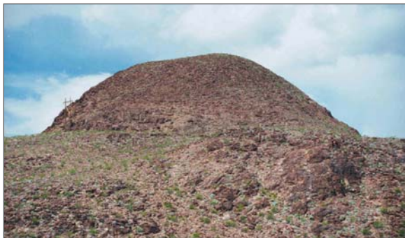
Traditional cultural properties

After a nationwide search, the National Park Service and the National Conference of State Historic Preservation Officers selected the 106 Group to support them in an extensive project to produce a publication on new strategies for cultural resources surveys in the United States. This publication will provide guidance for the planning and implementation of surveys, identification and evaluation of significant historic and archeological properties, and use of survey information for future planning and preservation decision-making purposes.