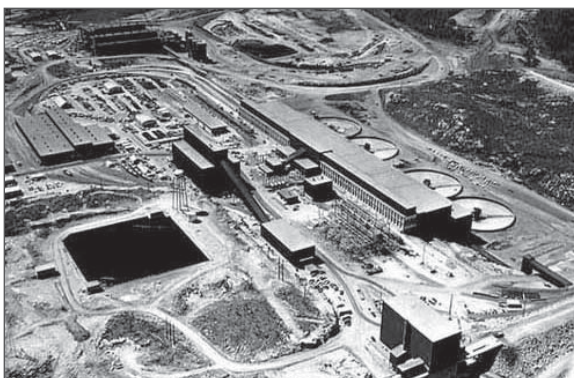
Erie Mining Company Facility, 1955

The 106 Group has extensive experience studying and reviewing effects of proposed projects to historic mines, including historic structures, archaeological resources, and cultural landscapes. Examples include: