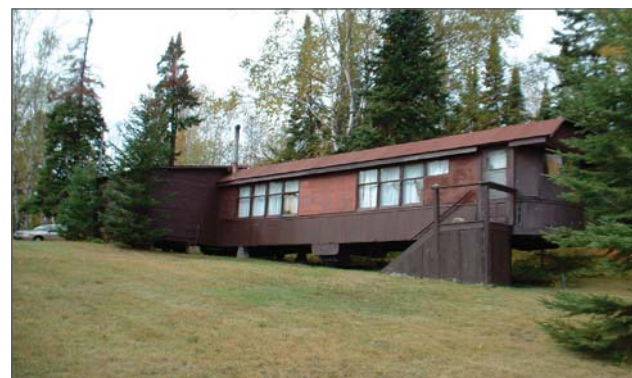
Gitchi Gami Trail, 2002