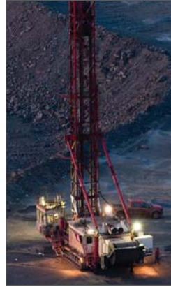
Hibbing, Minnesota, 2008