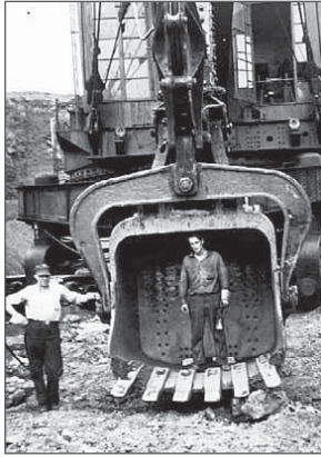
Hill Annex Mine ca. 1940