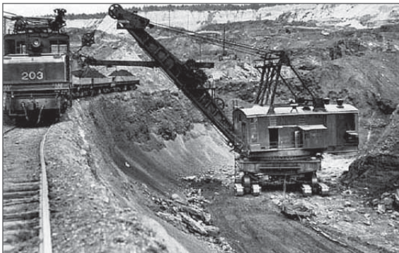
Hill Annex Mine ca. 1941